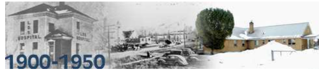
Pictured: Hospital (Old tithing house); construction on old hospital; and the old hospital as it looks today